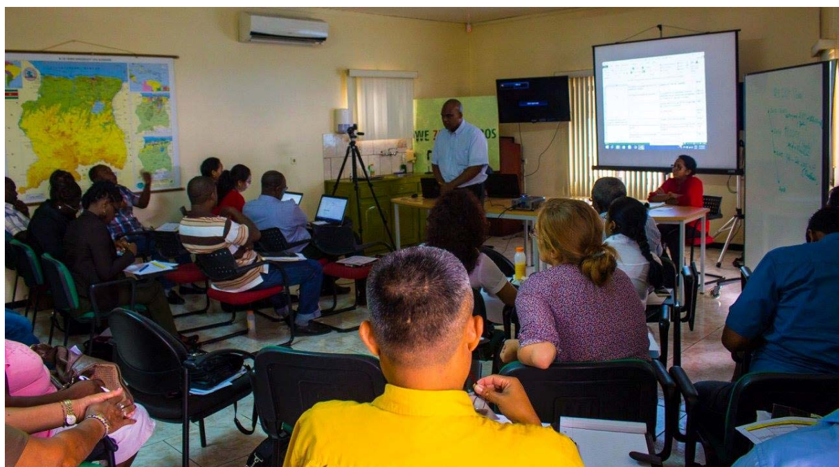
July 28, 2015: First Project Board meeting