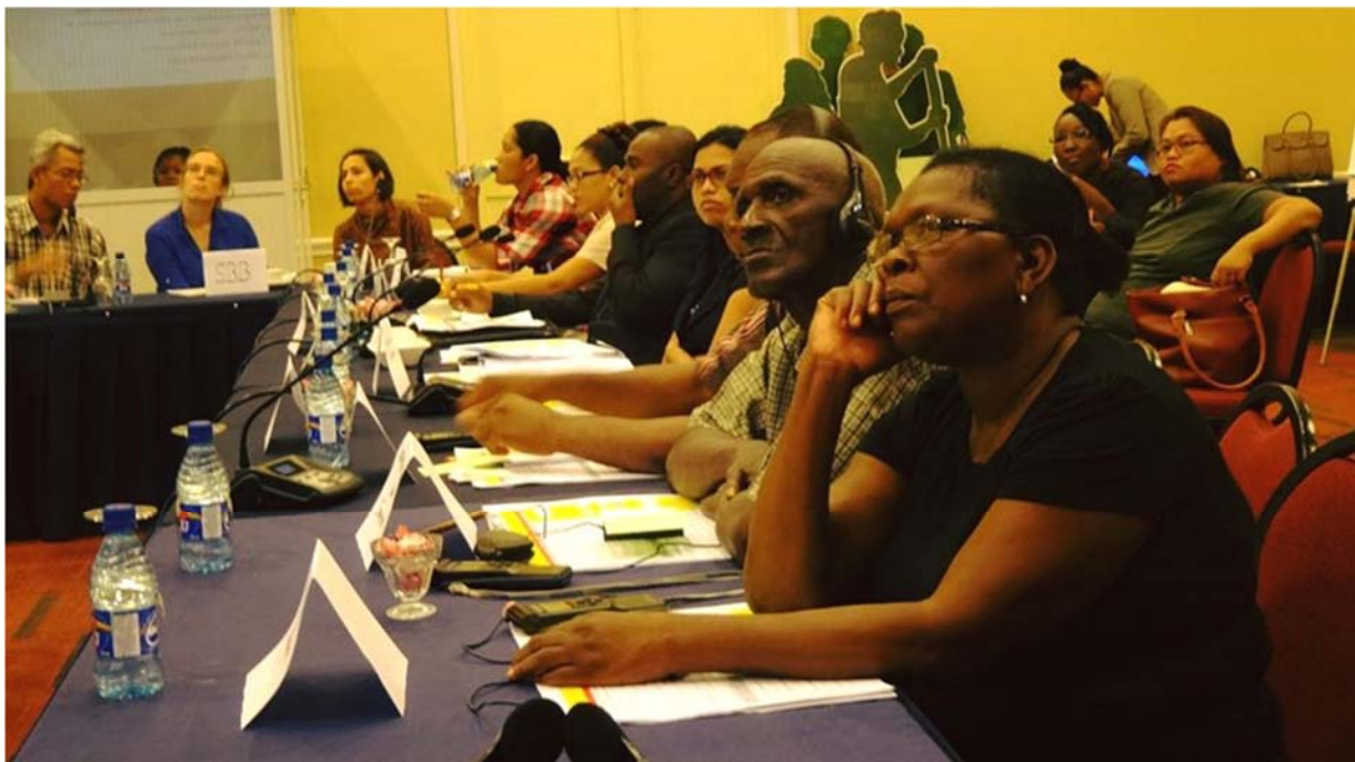
27 November 2015: 2nd Project Board meeting